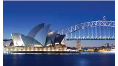
Opera House, Sydney