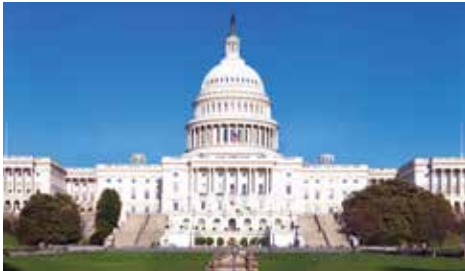
United States Capitol, Washington

Since 1874, we've provided air quality solutions for some of the most complex structures in the world. And for over 40 years, York is the chosen brand by Canadian consumers when it comes to ensuring year-round comfort for their loved ones. And because York units are designed and built in North America, you can be confident that your system will provide your family with comfort, energy savings and lasting performance.