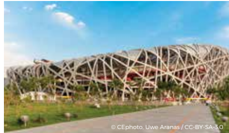
National Stadium, Beijing